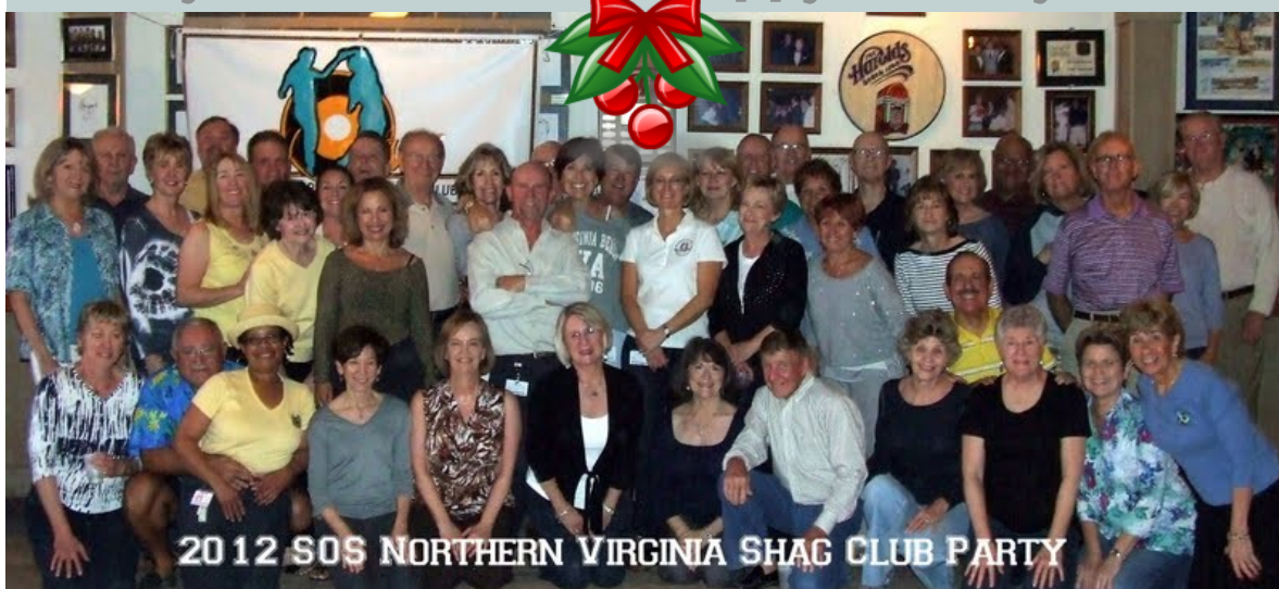
2012 SOS NORTHERN VIRGINIA SHAG CLUB PARTY