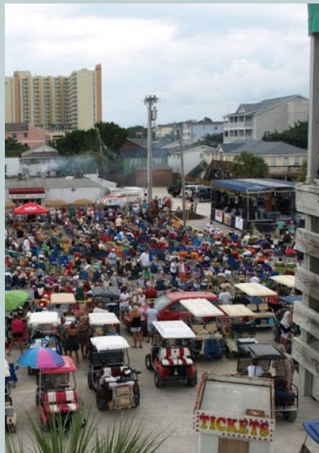
The large crowd at Fun Sunday enjoys the music during Fall Migration.

At least 65 clubs will have elections that the results will take effect in January. July has 5 clubs, March 4, May and June 3, October 2, February, April, August, November, and December 1. There are none in September, and there are 11 that could not be determined. Also noted was that 10 clubs have no websites, or their site doesn't work, has no information, or has no information that is new in over a year. Communication is the key to people knowing about your club and events. With this large turnover of presidents in the month of January, clubs will be undergoing significant change all at the same time. Hopefully, this newsletter can assist in the transition process. One of the resources that would be of great value in helping the new presidents, is our shag icons. This group of individuals has exemplified the characteristics that would greatly serve new presidents in making this transition a smooth one. We hope to utilize these individuals in the near future as a source for information and assistance.