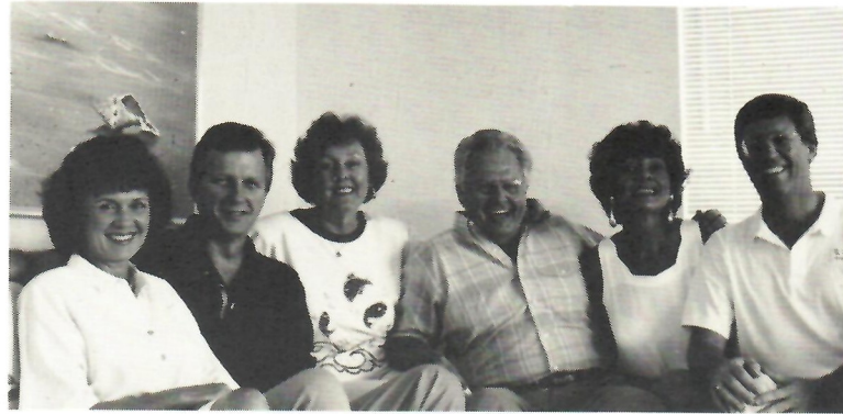
Charter Members Good Time Shaggers 1992 SOS Fall Migration