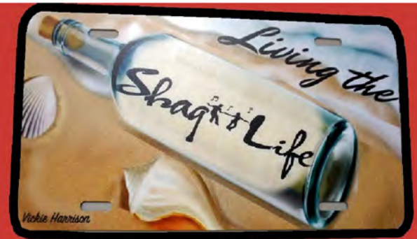
Shag Life Tag

Affordable Apparel & Accessories Visors, Coozies, Shot Glasses & Much More