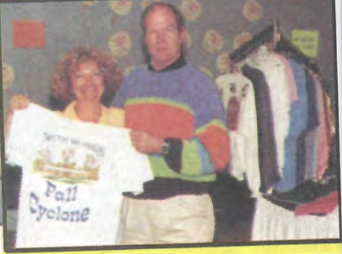
... no problem for the "FunBunch" ... just bring 'em