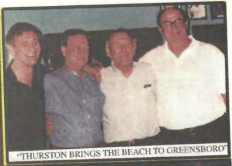
"THURSTON BRINGS THE BEACH TO GREENSBORO"