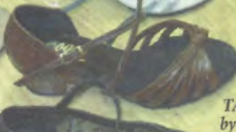
TANGO by Coast