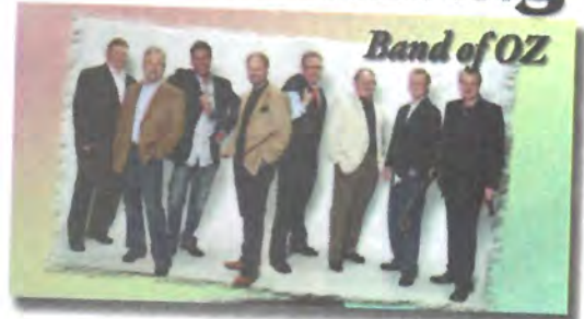
Band of OZ