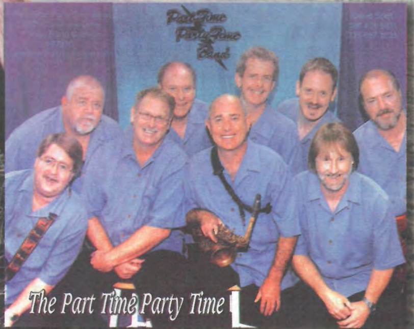
The Part Time Party Time