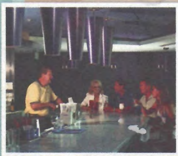
Enjoy Happy Hour daily and live Beach Music Friday and Saturday, 7-11 pm in our Tree Top Lounge.

-FALL MIGRATION- Beach Music on Friday and Saturday In our SMOKE-FREE Ballroom