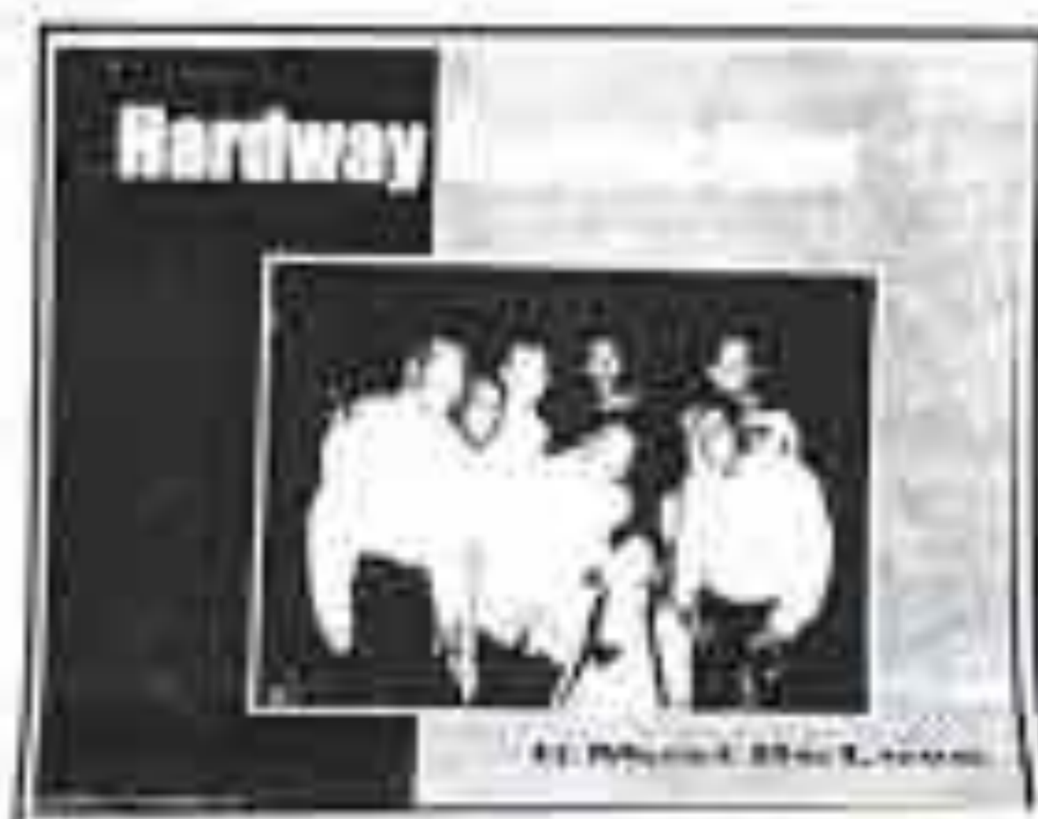
Hardway Connection It Must Be Love