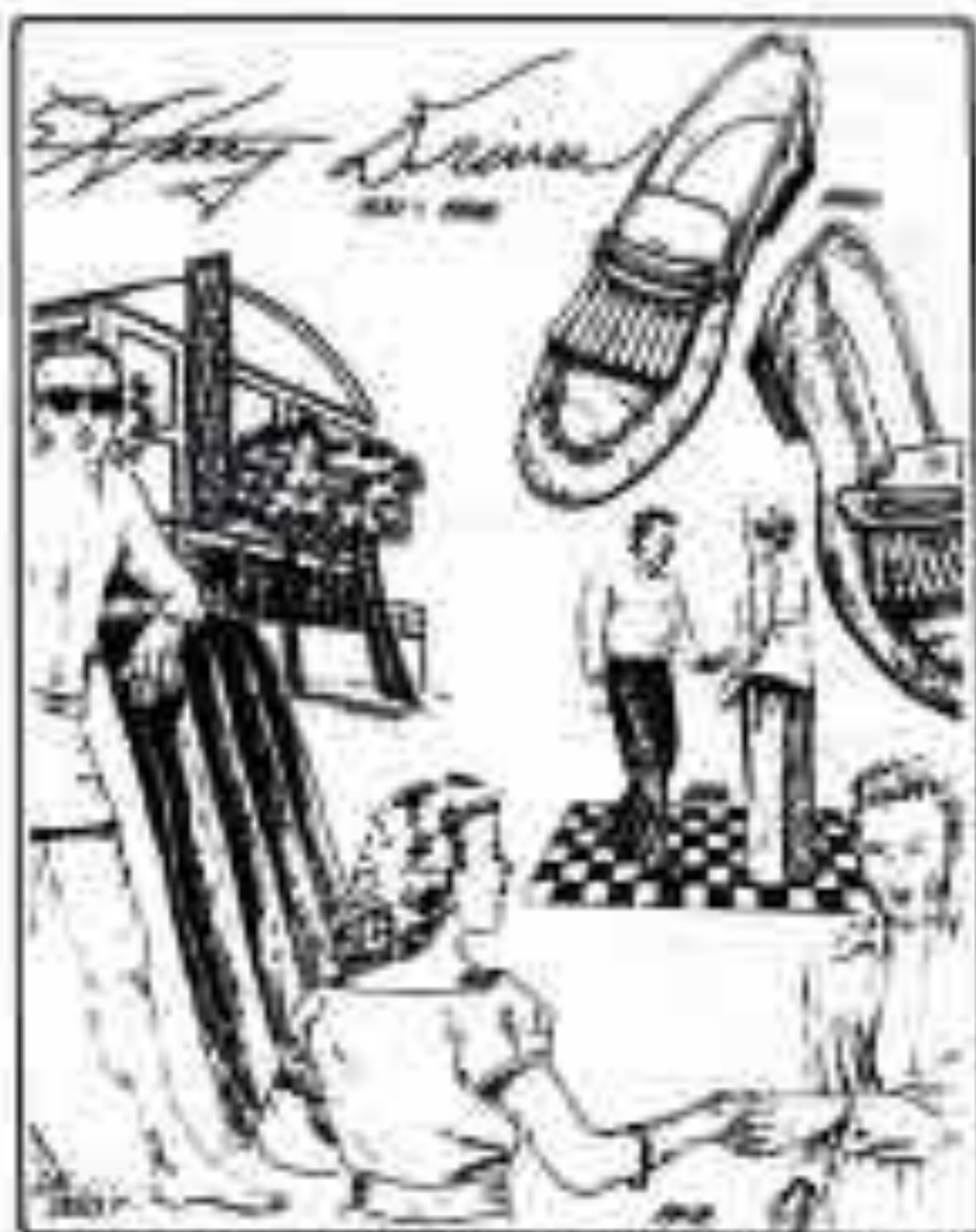
ACTUAL PRINT WILL BE IN COLOR AND APPROX. 10X14. THE ART LINE DROPPED TO FIT CHASE.