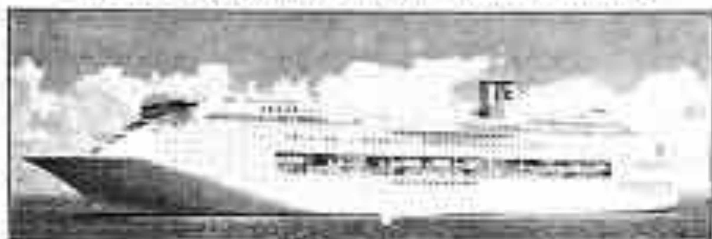
MV Costa Victoria

We have chosen a cruise that combines the best value, the best trip, and the most fun for the money!