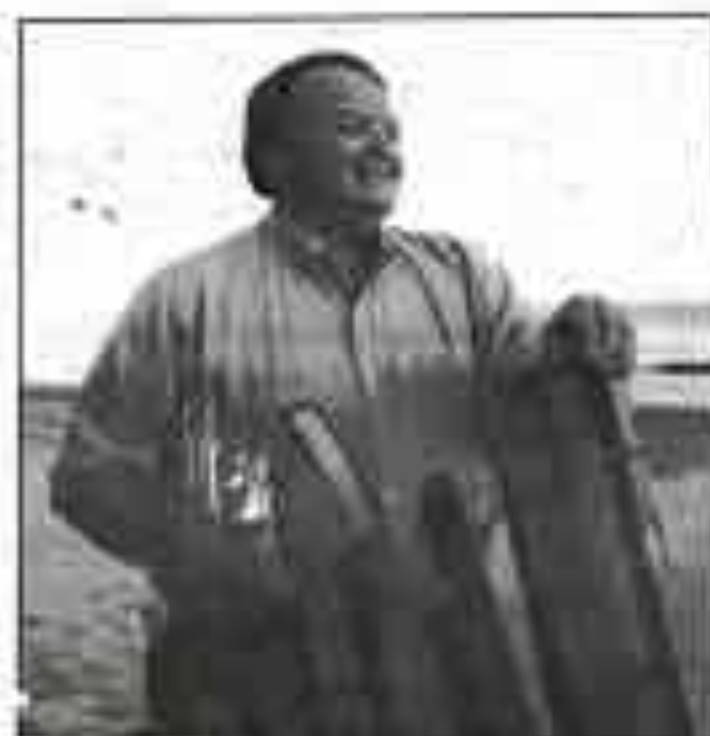
Beaver Greenway Pastor To The Locals