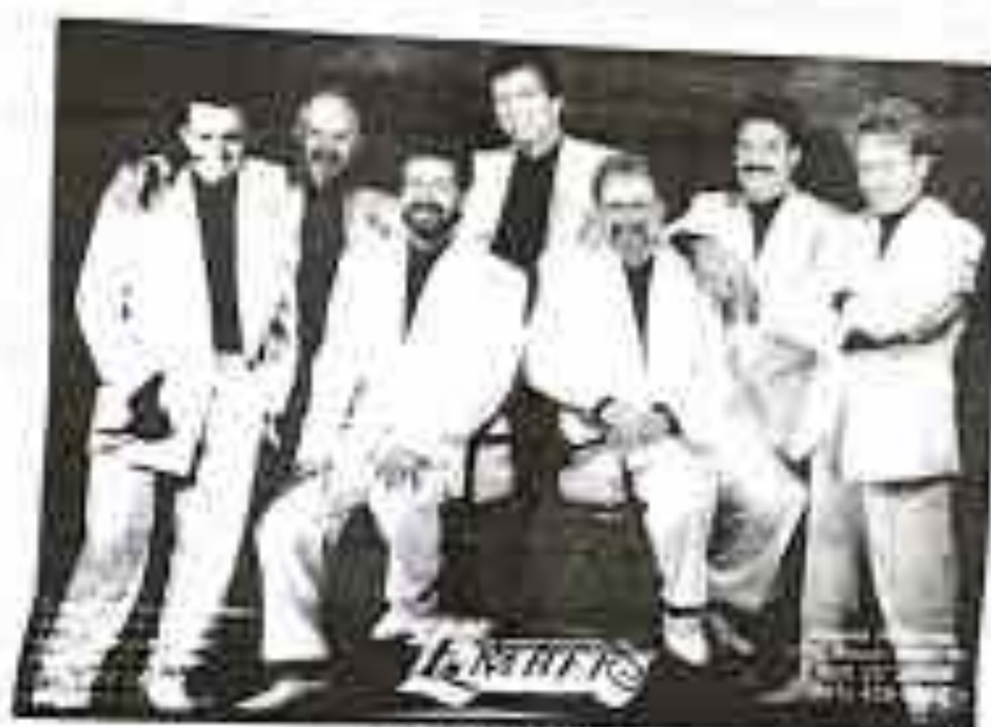
The Embers Appearing Thursday, September 21, 9 PM