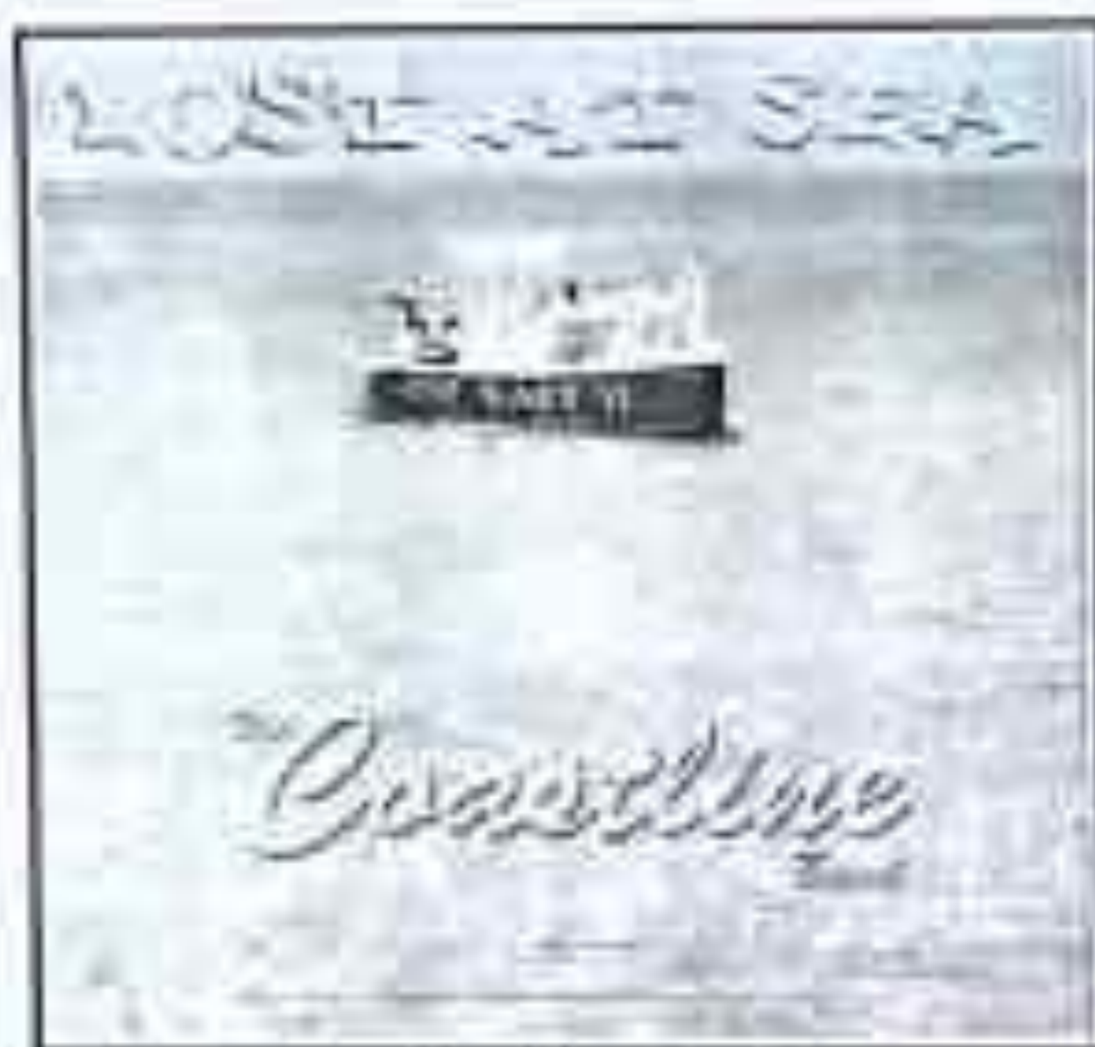
Coastline Band "Night & Day" • "It's Gonna Rain" • "New Old Songs"