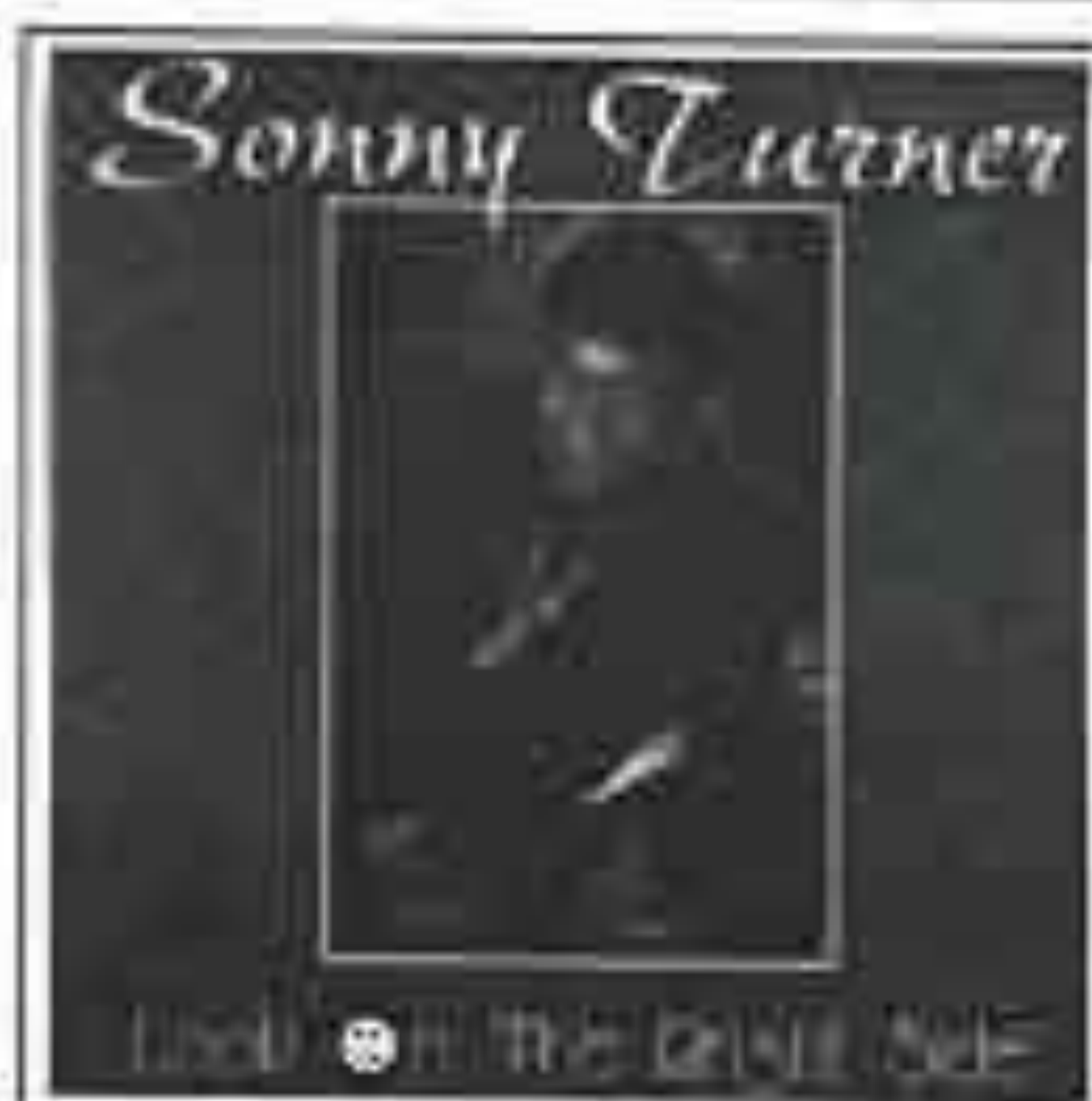
Featuring Stagger Lee, Clifford's Blues, and Tell Me Her Name

New for Fall S.O.S. '97 — Only $11.95 — Sept. 5 thru Sept. 14 only Beach, Boogie, and Blues Records, CD's, and Tapes. We mail order anywhere in the U.S.