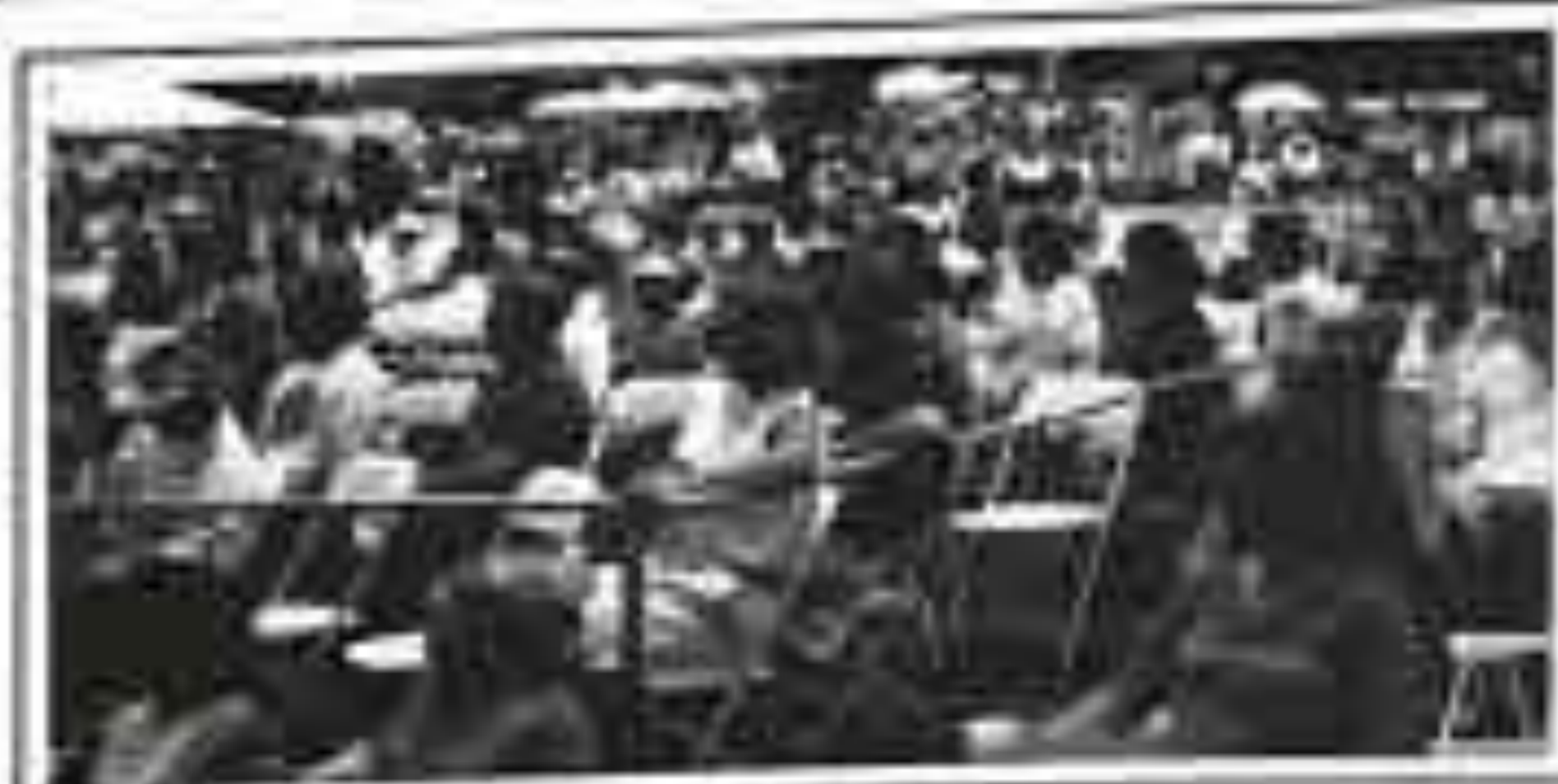
It was indeed a Magic Moment!

We settled in for what would be three days and three nights of heaven on earth for lovers of beach music. Nothing could be finer. Friday afternoon opened with a couple