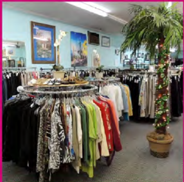
Women's Clothing * Home Decor * Accessories