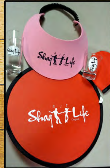
Visors, Coozies, Fans, Shot Glasses & More