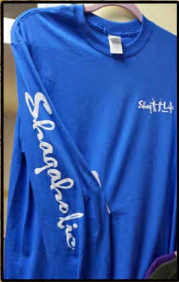
Long Sleeve T-Shirts