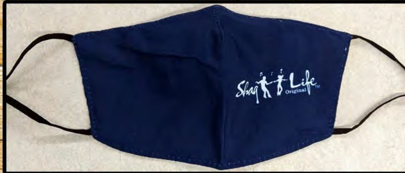
New Adjustable Face Mask