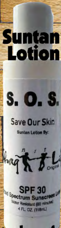
Stock up for Spring/Summer