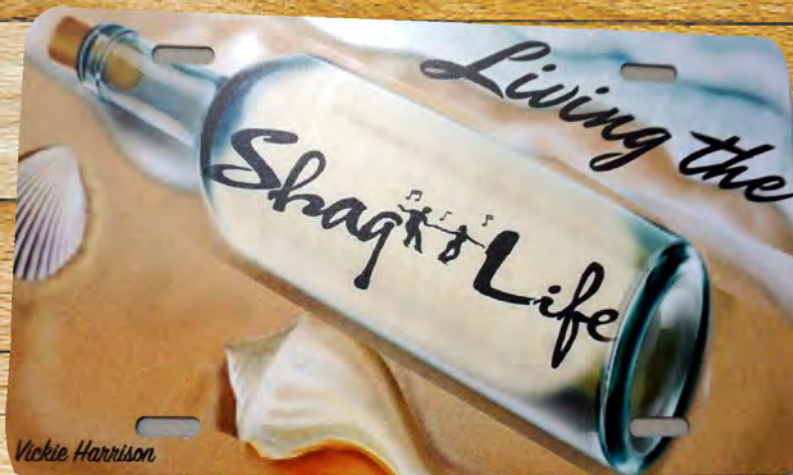
Show off your Car, Golf Cart or Bicycle with an Shag Life Tag