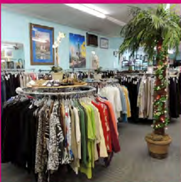
Women's Clothing * Home Decor * Accessories

PRESENT YOUR SOS CARD TO RECEIVE AN ADDITIONAL 5% OFF ONE ITEM!