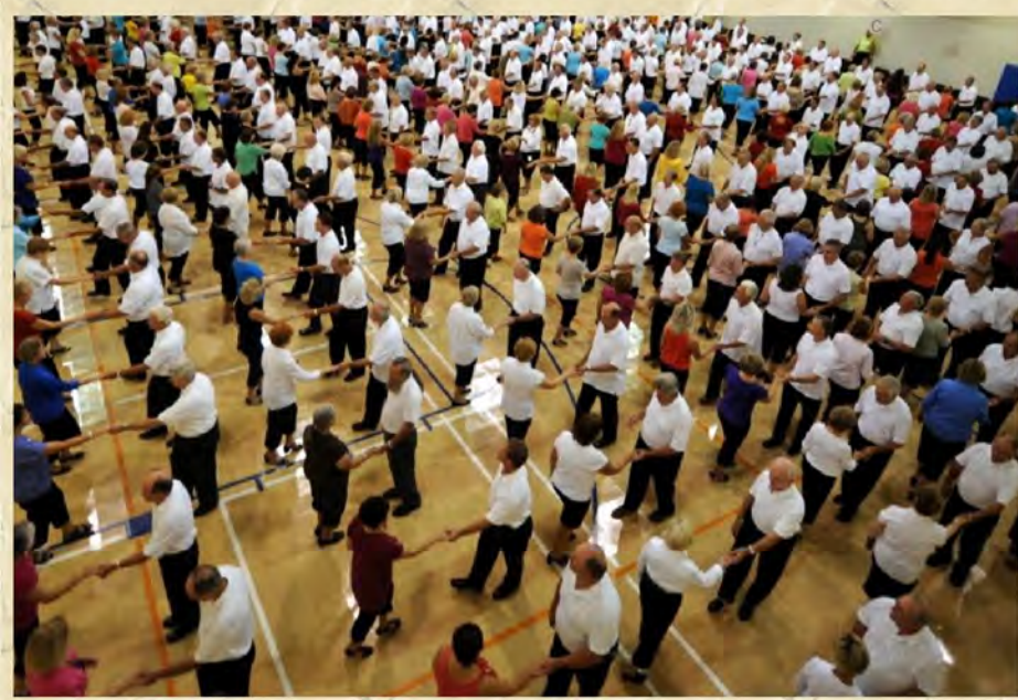
INSERT FROM GUINNESS WEBSITE: