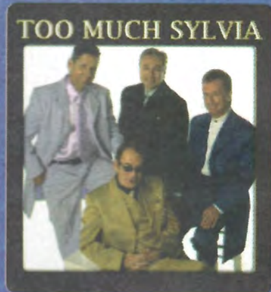
TOO MUCH SYLVIA