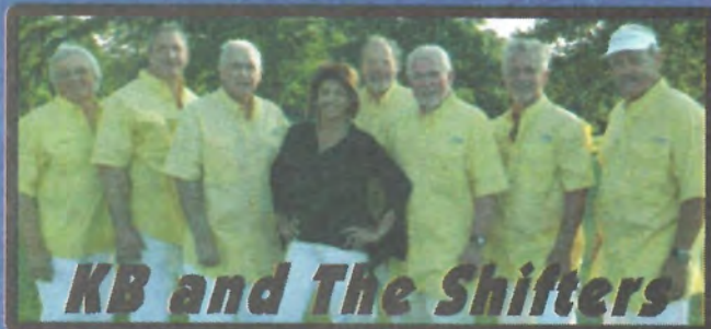
KB and The Shifters