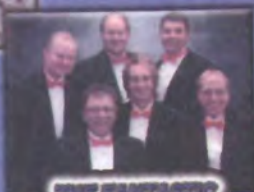
THE FANTASTIC SHAKERS 12/30