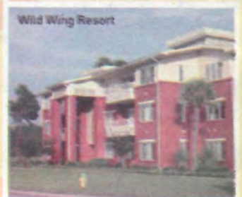
Wild Wing Resort

or book online at www.ExtraHolidays.com/myrtle