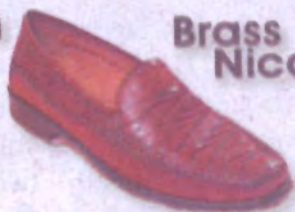
Brass Boot Nicolo