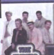
THE EMBERS 12/29

SHOW YOUR NY'S EVE TICKET FOR FREE ADMISSION ALL 3 NIGHTS