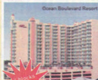
Ocean Boulevard Resort

Luxurious Oceanfront Condos & Deluxe Golf Villas