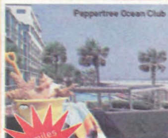
Peppertree Ocean Club

Great Myrtle Beach and North Myrtle Beach locations