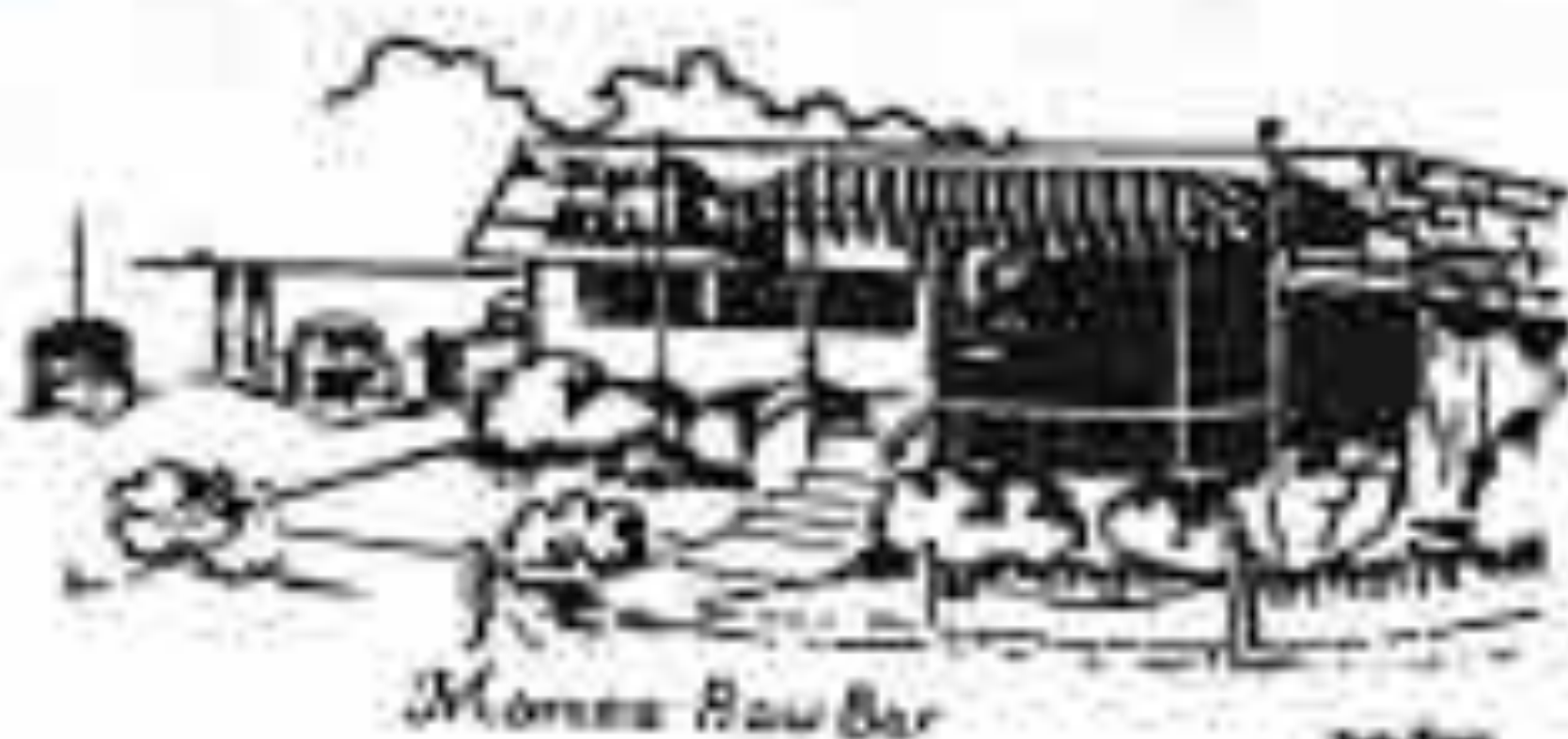
Marina Raw Bar