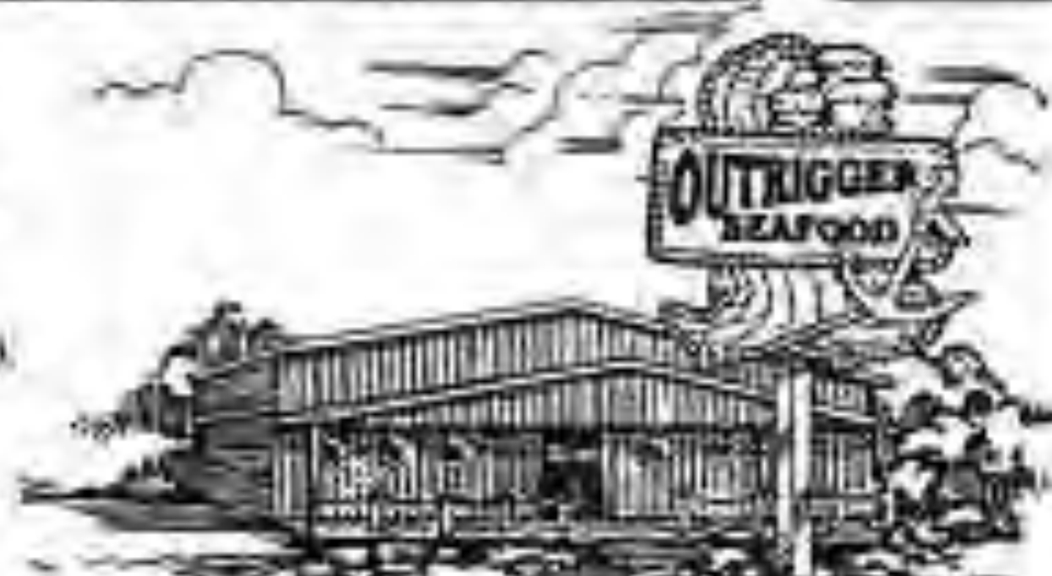
Open Nightly • Your Host Ladies Upchurch

Special Kids All You Can Eat Menu $2.98 to $3.95