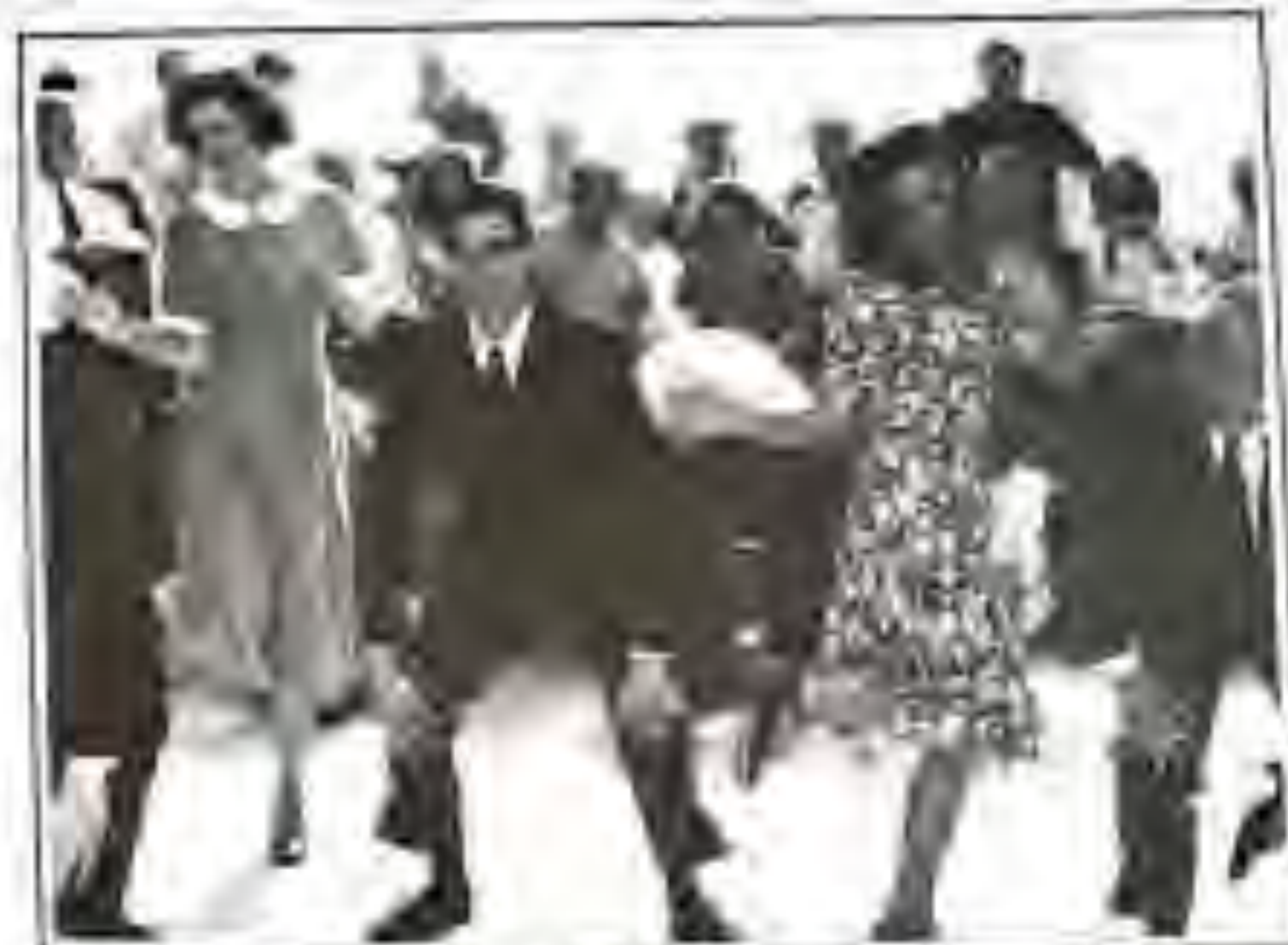
American Dance Ensemble brings down the house at Old Cafe